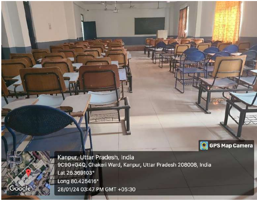
NSH (New Seminar Hall)